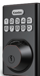
Oil Rubbed Bronze