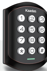
Oil Rubbed Bronze